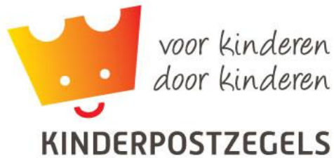
Stichting Kinder postzegels (SKN) Netherland